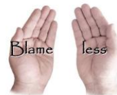
A Sermon from Titus 1:5-9